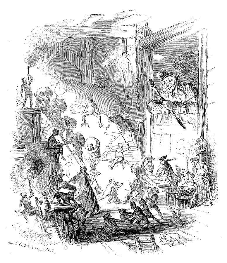
NED. GERAGHTY'S LUCK.